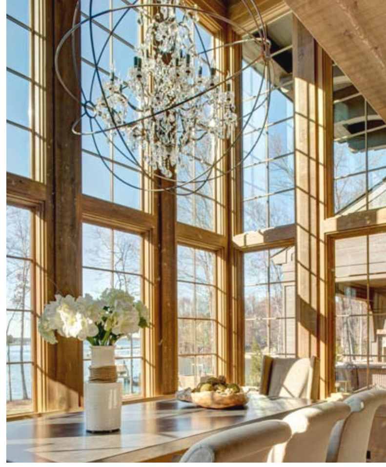
"This project is a true testament to not going huge and massive, which then allows investment into higher quality concepts and materials."